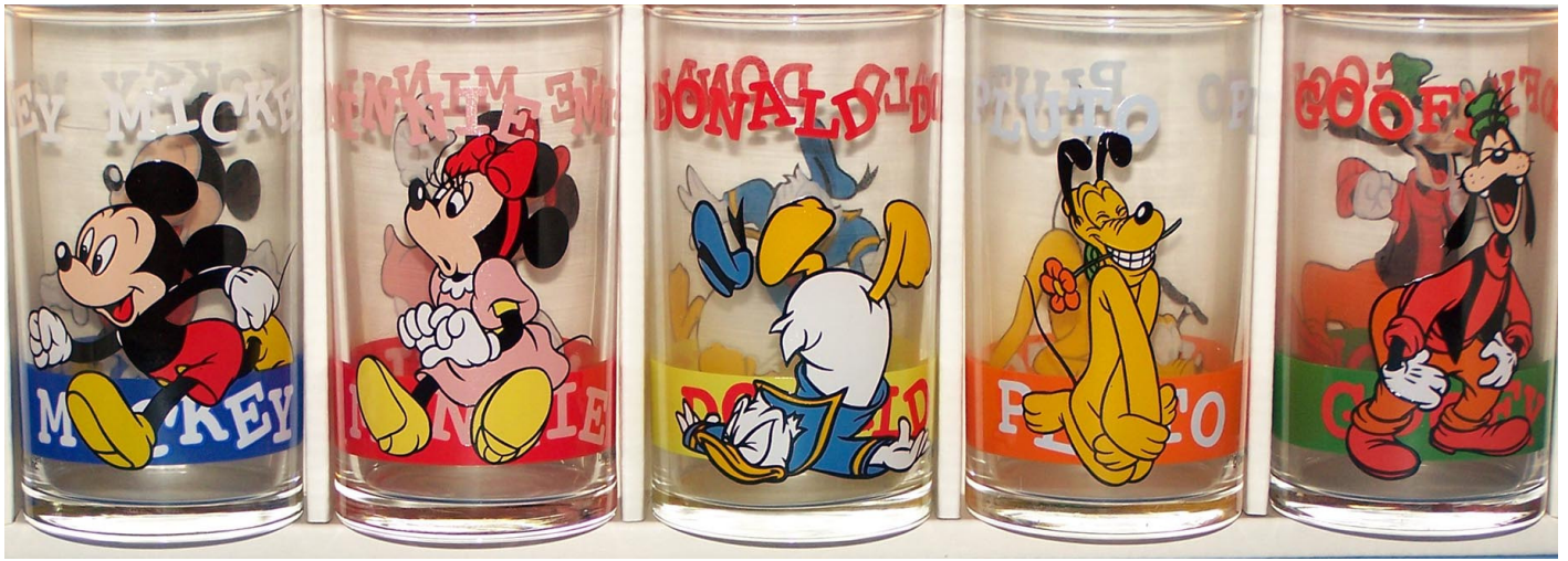
This is a boxed set of five very colorful Disney glasses. Disney Enterprises, Inc. 4 1/4"