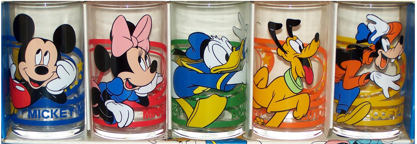
Boxed set of five Disney glasses. Disney Enterprises, Inc. Sponsored by Dai-Ichi-Life, an insurance company.