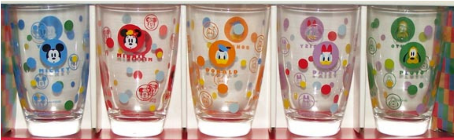
Boxed set of five Disney glasses. Disney Enterprises, Inc. Sponsored by Dai-Ichi-Life, an insurance company.